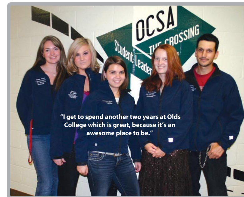
"I get to spend another two years at Olds College which is great, because it's an awesome place to be."